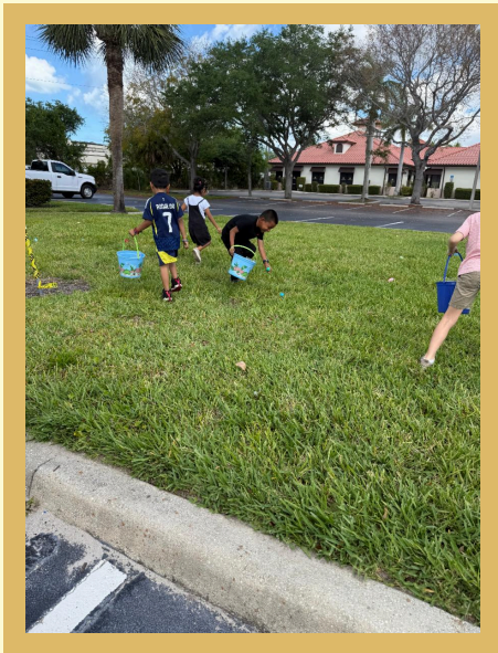
Young children carry plastic buckets as they search for eggs on the ground.